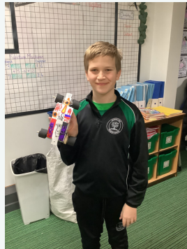
Y1 - learning about Australia