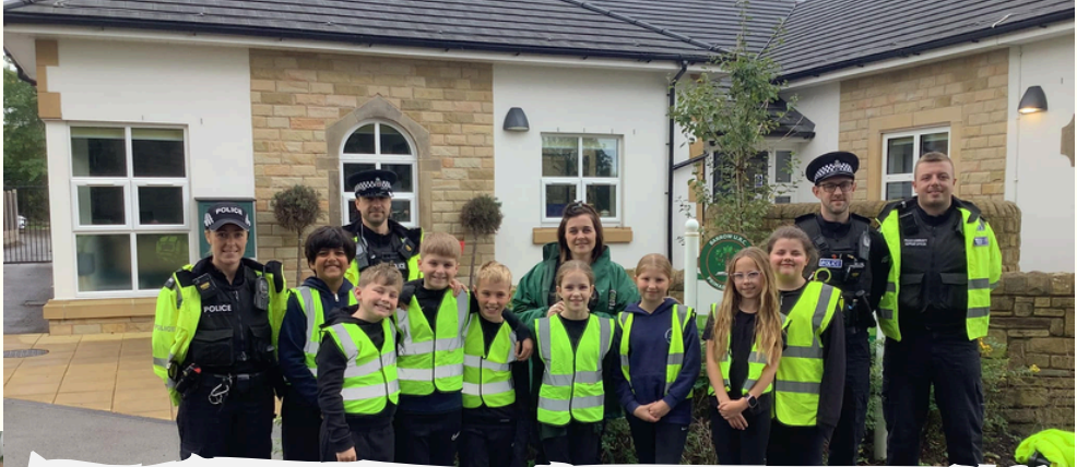
House Captains working with the police to check and stop drivers speeding through the village.