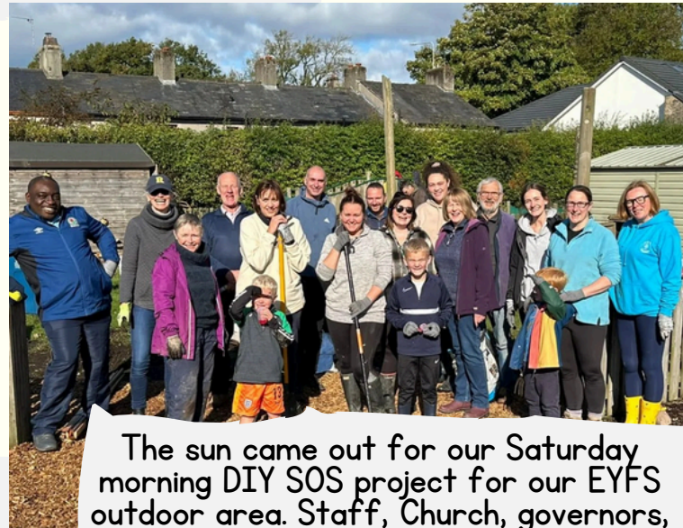
The sun came out for our Saturday morning DIY SOS project for our EYFS outdoor area. Staff, Church, governors, families and local trades people joined us for some digging!