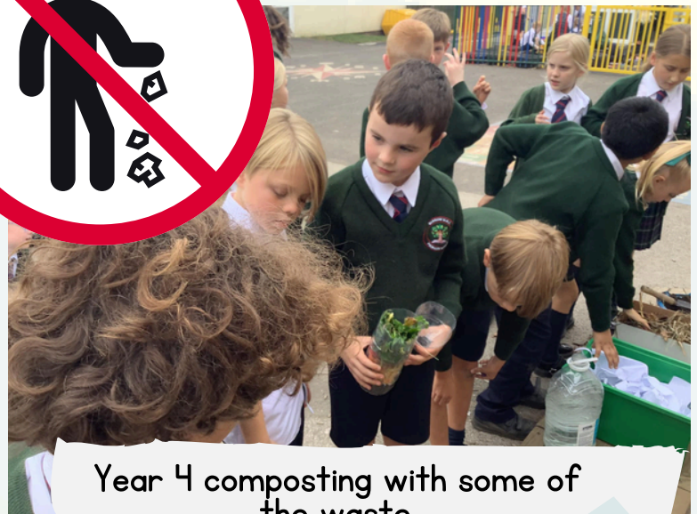
Year 4 composting with some of the waste.