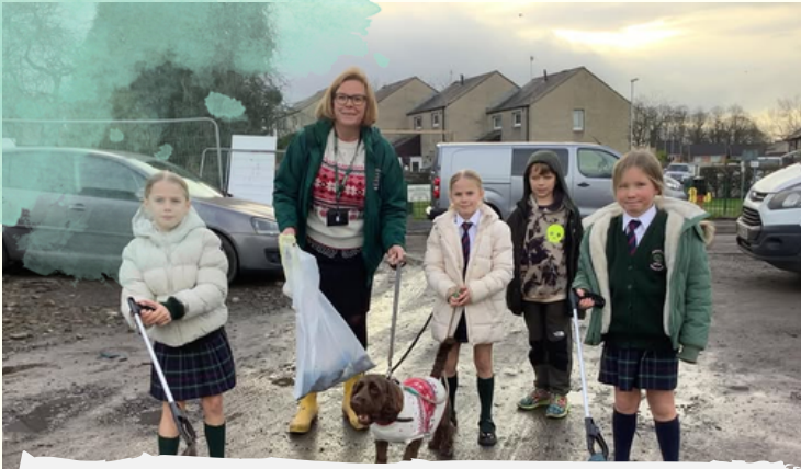
Litter picking in the village with our school dog Ludo