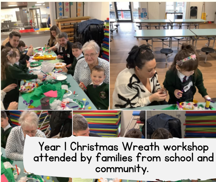
Year 1 Christmas Wreath workshop attended by families from school and community.