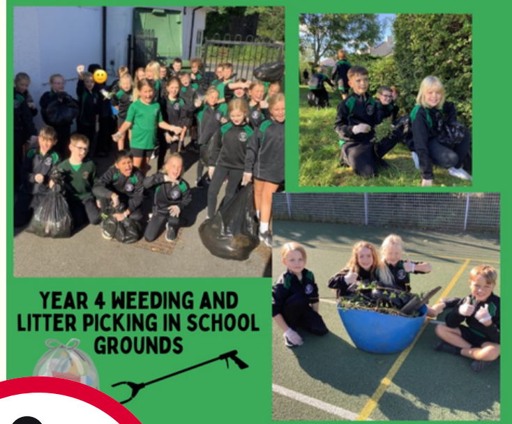
YEAR 4 WEEDING AND LITTER PICKING IN SCHOOL GROUNDS