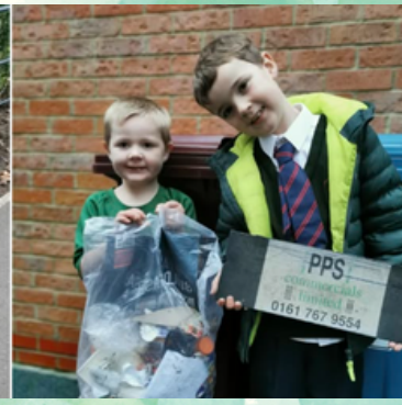
Brothers litter picking on their way home from school!