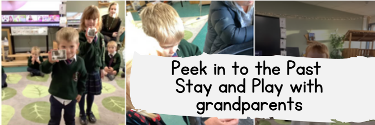
Peek in to the Past Stay and Play with grandparents