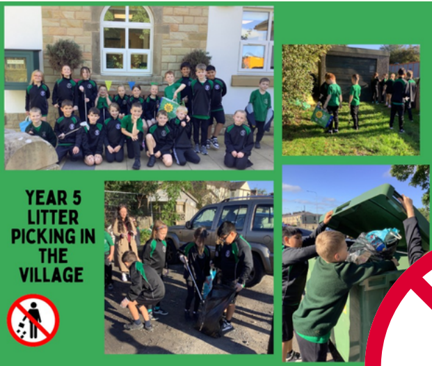
YEAR 5 LITTER PICKING IN THE VILLAGE