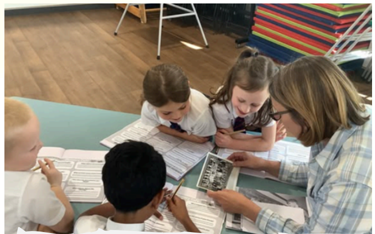
Year 3's Memory Cafe - looking into the past of Barrow and people that live in the village.